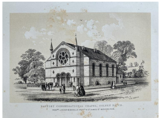
Original church on Grove Road

It was in 1859 that a small group of Christians in the rural village of Colney Hatch began to meet at the Clock and Watchmakers Almshouses - now the corner of Waterfall Rd that meets Betstyle circus. Colney Hatch was a village of 2000 people with only an Anglican church.