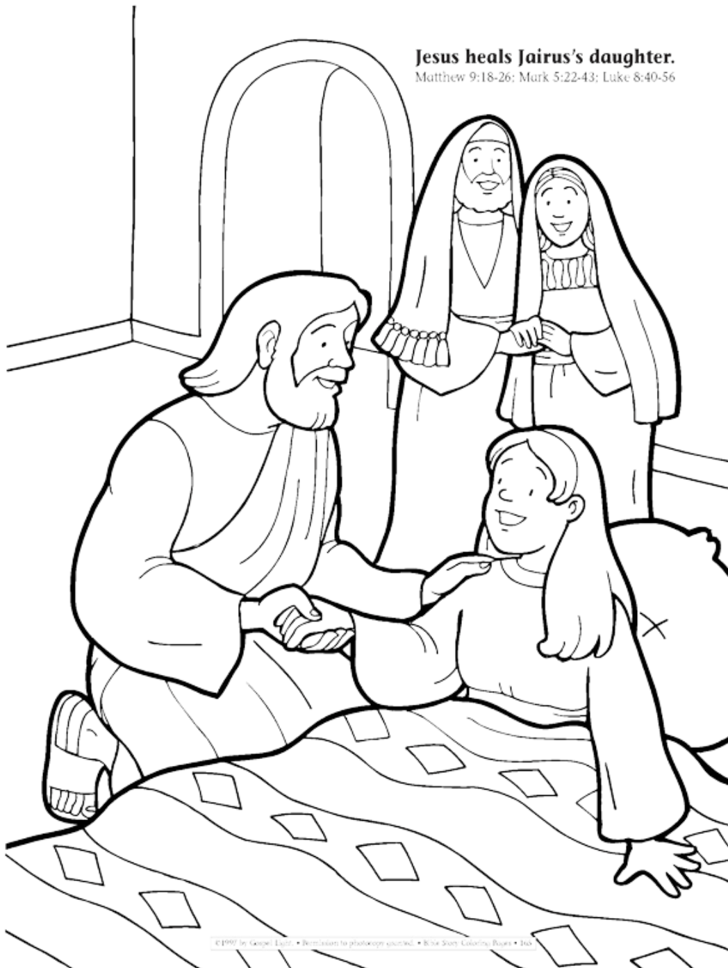
Jesus heals Jairus's daughter. Matthew 9:18-26; Mark 5:22-43; Luke 8:40-56

©1997 by Gospel Light • Permission to photocopy granted • Bible Story Coloring Pages • Ink